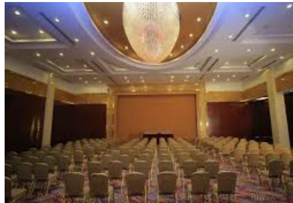
Inter Luxury Hotel (Addis Ababa) - https://interluxuryhotel.com/